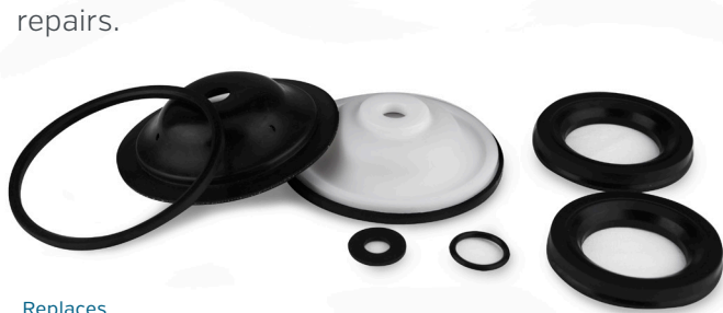
Replaces Alfa Laval ARC Service Kit

With a wide variety of Flowtrend manufactured wear parts for all major OEM suppliers' sanitary products, Flowtrend offers an impressive line-up of replacement parts, in stock and ready to ship the same day, reducing downtime and maintenance costs. Backed by an unconditional quality guarantee and at a fraction of name-brand prices, our products free you from dependence on the original manufacturer and its prices for replacements and repairs.