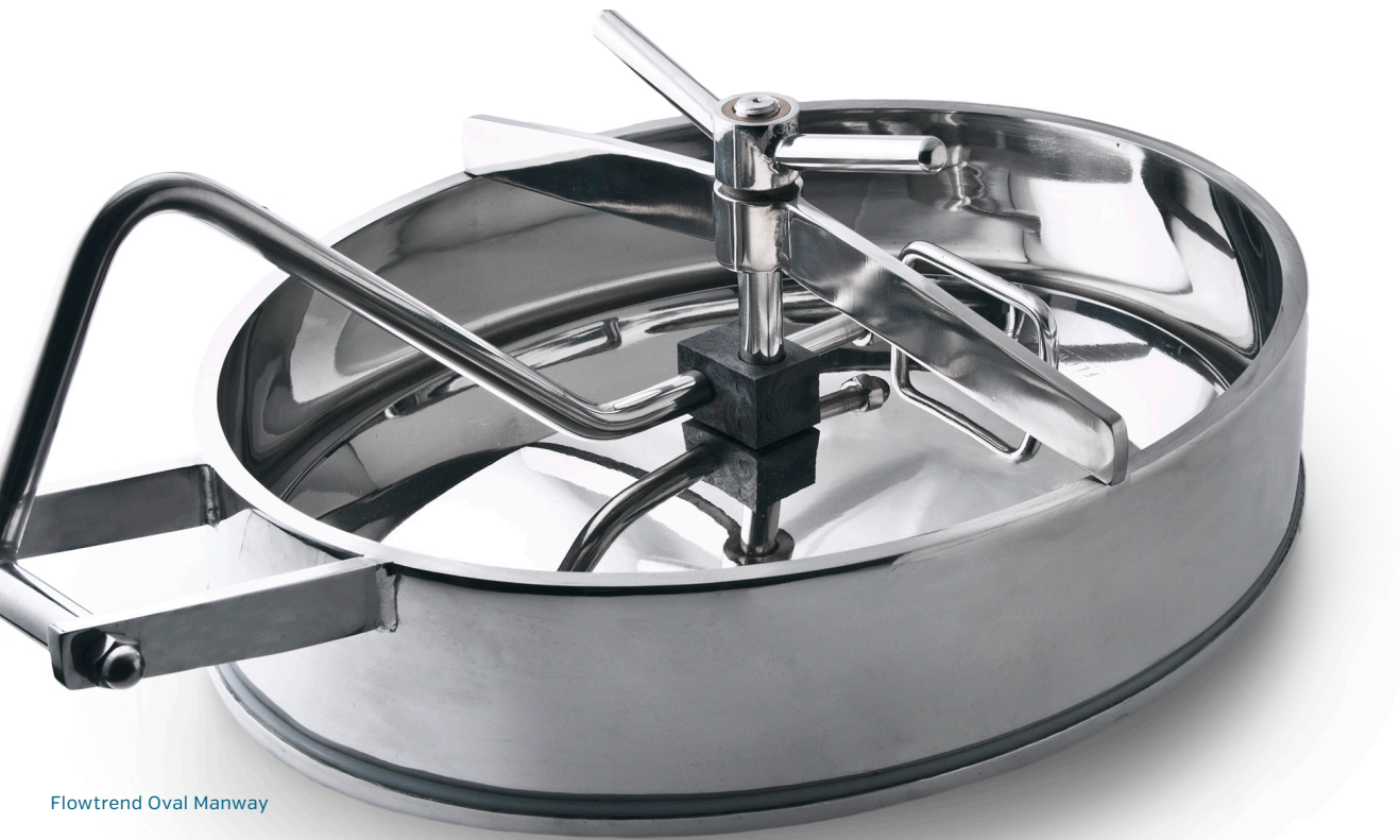
Flowtrend Oval Manway