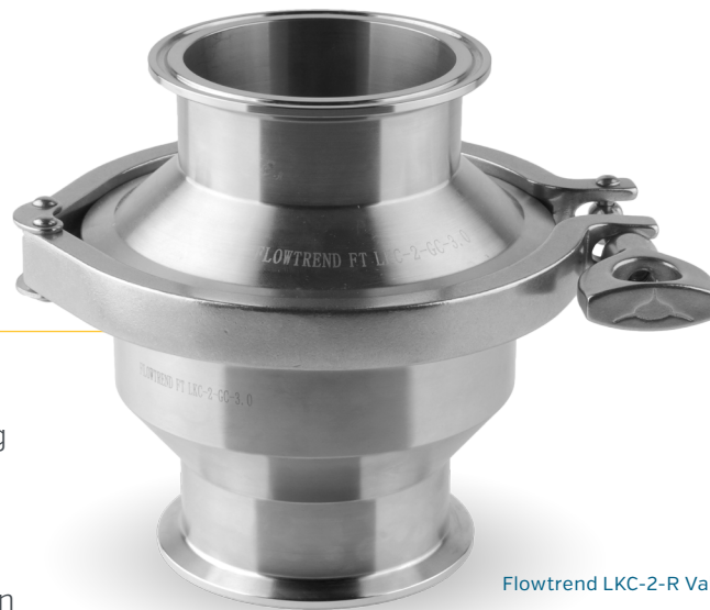
Flowtrend LKC-2-R Valve

Flowtrend has a diverse line of valves to accommodate a variety of operating conditions found in the sanitary industries. From the Flowtrend ARC-R Seat Valve that is well suited for aseptic conditions and high sterilization temperatures, to the Flowtrend SRC-R available in both divert and shut off with an easily repairable actuator, Flowtrend offers a full line of high quality valves intended to be interchangeable with the OEM products.