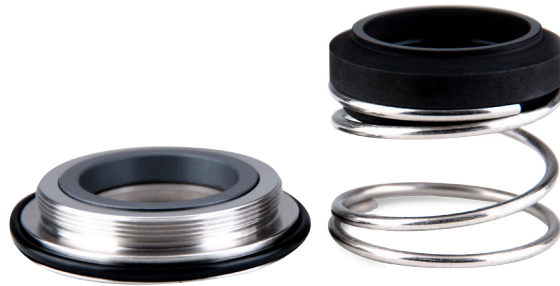
Replaces LKH 5-60 Pump Seal, Stationary & Rotary

With a wide variety of Flowtrend manufactured wear parts for all major OEM suppliers' sanitary products, Flowtrend offers an impressive line-up of replacement parts, in stock and ready to ship the same day, reducing downtime and maintenance costs. Backed by an unconditional quality guarantee and at a fraction of name-brand prices, our products free you from dependence on the original manufacturer and its prices for replacements and repairs.