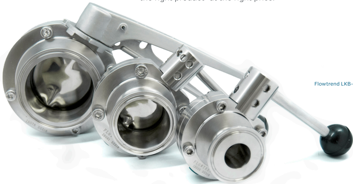
Flowtrend LKB-R Valves

Flowtrend's experienced staff of experts and technicians from the world's leading fluid handling providers will help you find the right product—at the right price.