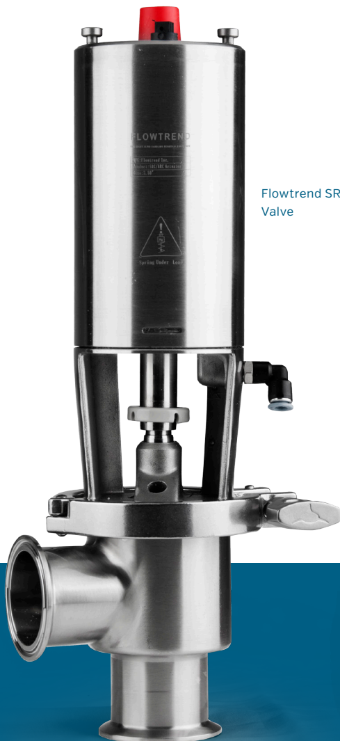
Flowtrend SRC-R Valve