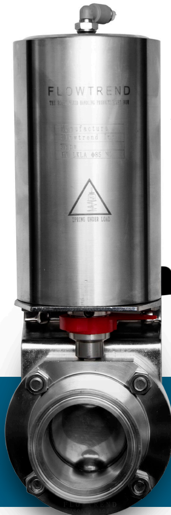
Flowtrend LKLA-R Valve