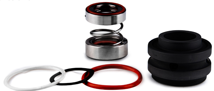
Replaces Fristam FPX 633 Pump Seal Kit

Flowtrend® is the manufacturer of these products. Flowtrend® is not affiliated with, sponsored by or endorsed by any of the manufacturers listed in this document. Flowtrend parts and products are not Alfa Laval parts and products, and Alfa Laval® does not endorse, approve or warrant Flowtrend's parts or products or their use.