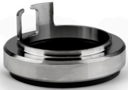
Replaces Contherm Rotary Seal