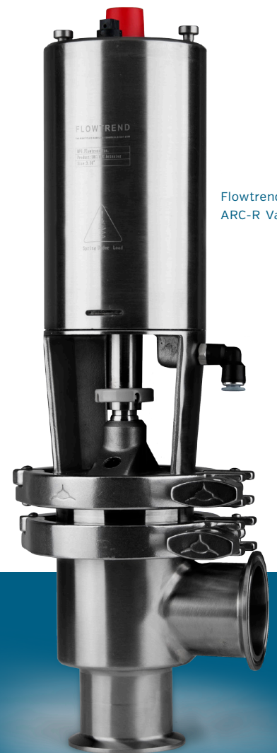
Flowtrend ARC-R Valve

Flowtrend® is the manufacturer of these products. Flowtrend® is not affiliated with, sponsored by or endorsed by any of the manufacturers listed in this document. Flowtrend parts and products are not Alfa Laval parts and products, and Alfa Laval® does not endorse, approve or warrant Flowtrend's parts or products or their use.