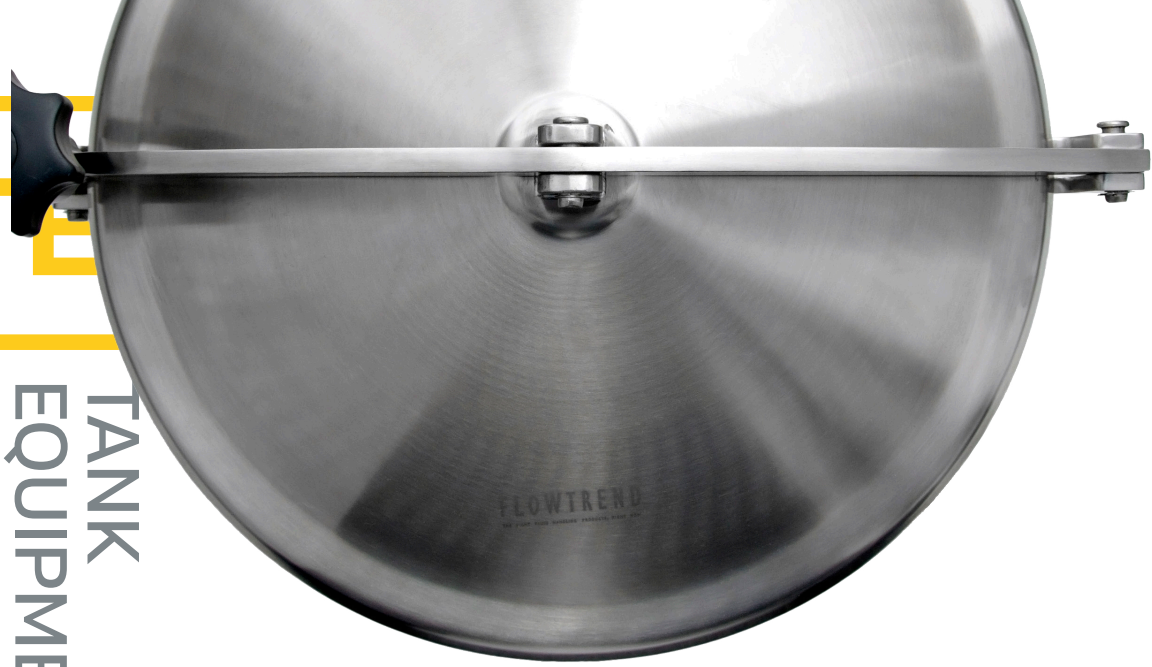
Flowtrend LKDC-R Manway